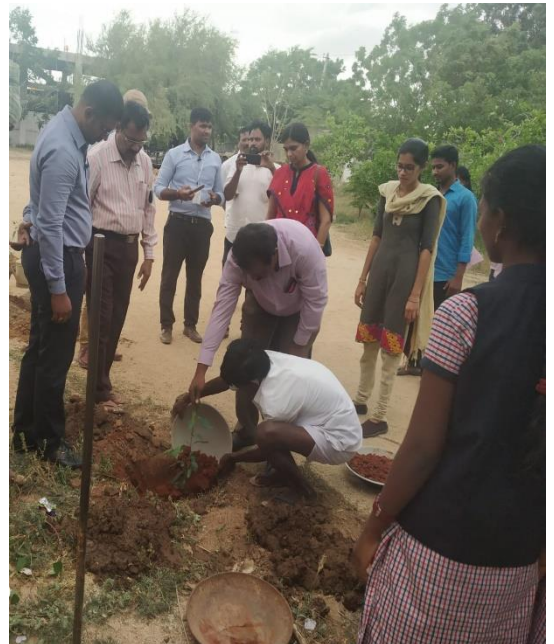
PLANTATION BY APSSDC