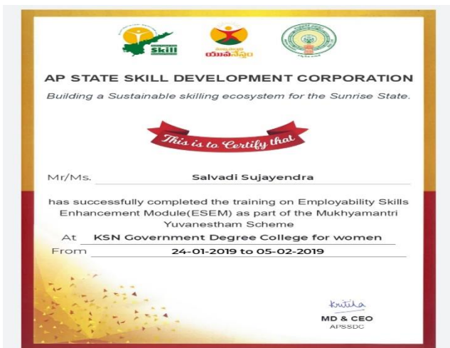
MYN COURSE CERTIFICATE