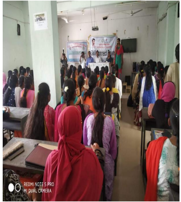
SKILL CONNECT JOB DRIVE