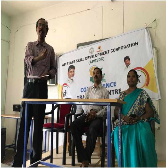
INAUGURATION OF MYN COURSE