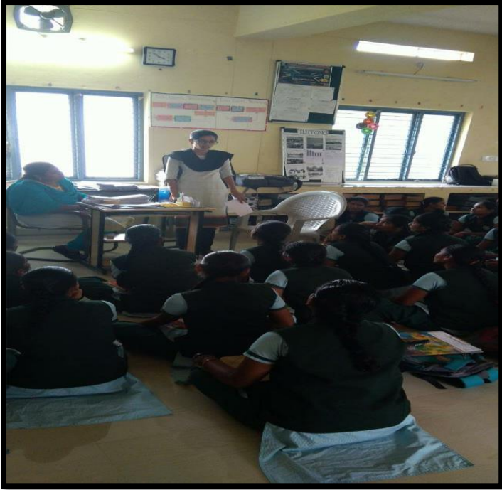
TRAINING FORTCS EXAM