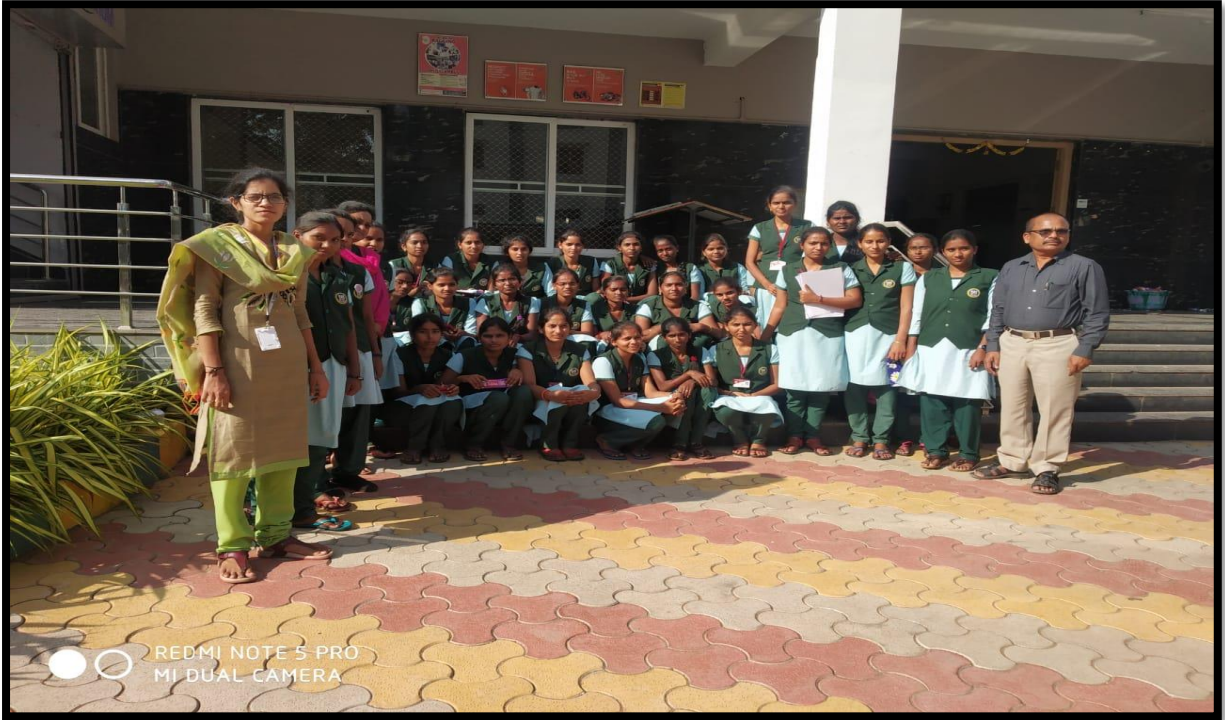
STUDENTS ATTENDING INFOSYS CAMPUS DRIVE